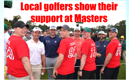
Local golfers show their support at Masters

Ainsdale Golf Course owners got to know famous country singer during their time in Oklahoma. And he even had a role in them getting together. Pg. 4-6